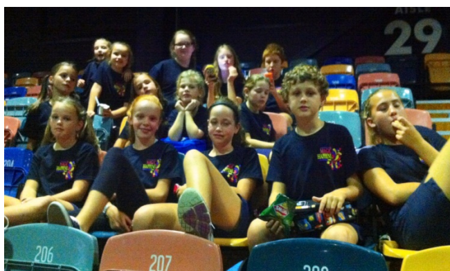
Waiting very patiently for our turn