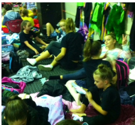
Just relaxing whilst waiting for our turn