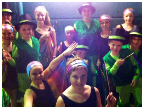
Costumes on and ready to dance