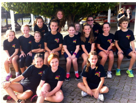
Enjoying our experience